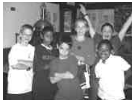
Maryland Relay brings new friends together for lunch.

Using the feedback received from teachers and administrators, the kit is under revision to include their